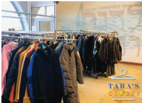
Racks of warm winter coats lined up for Tara's Closet's Coat Drive in the winter of 2019.

The need for mental health services has only increased during the pandemic. According to the Center for Disease Control (CDC), during late June 2020, nearly 40 percent of adults in the United States reported struggling with mental health or substance abuse. As an organization that provides mental health services to the Greater Hartford