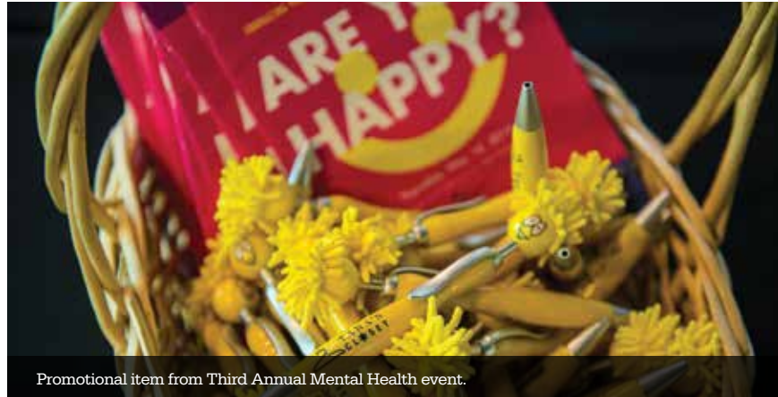
Promotional item from Third Annual Mental Health event.