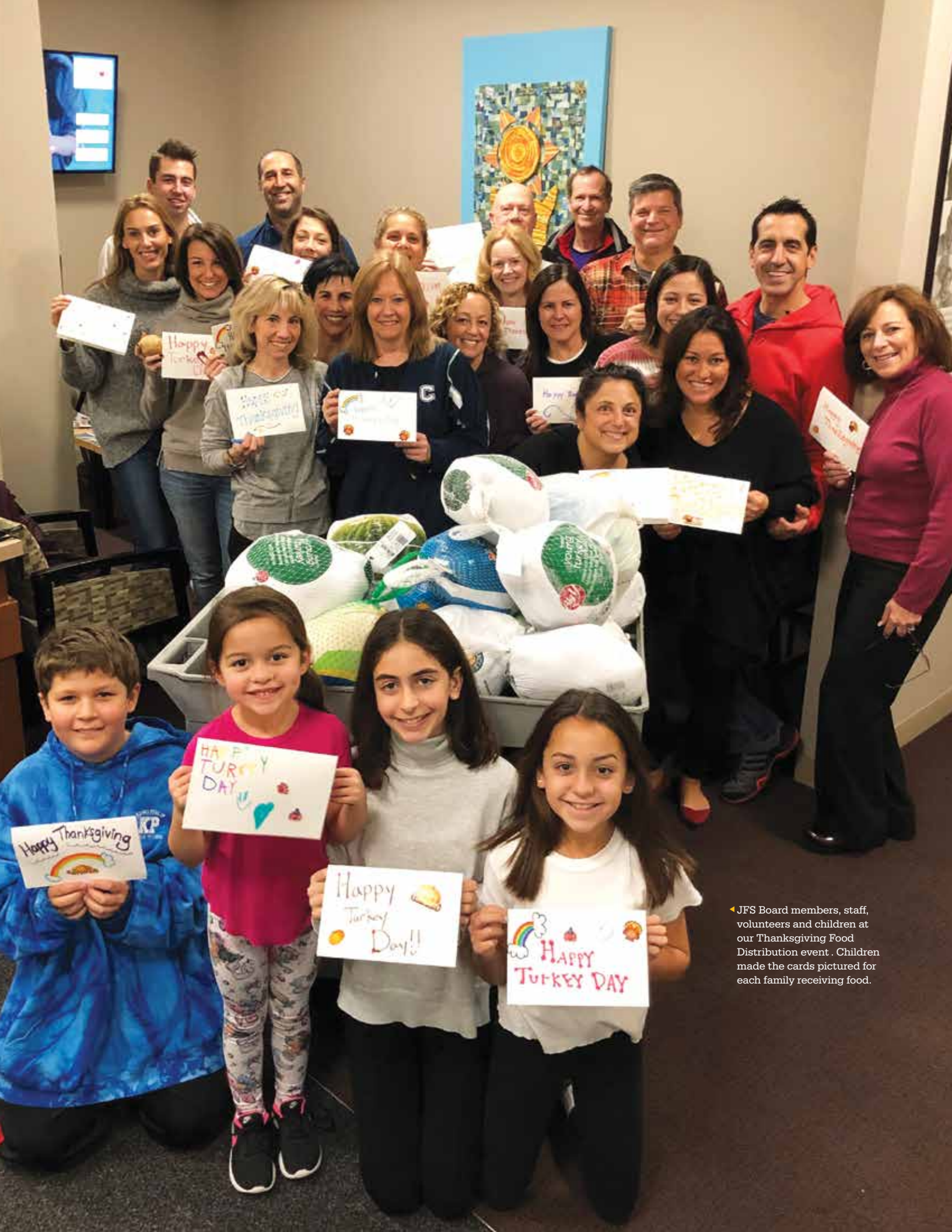
◀ JFS Board members, staff, volunteers and children at our Thanksgiving Food Distribution event. Children made the cards pictured for each family receiving food.