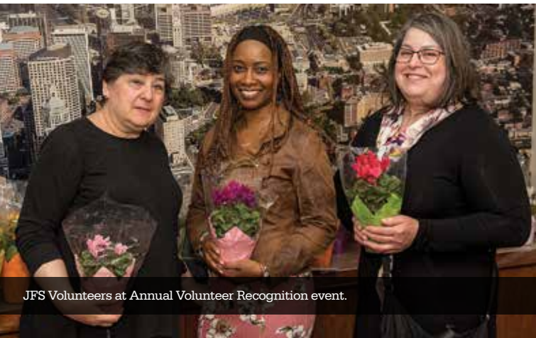
JFS Volunteers at Annual Volunteer Recognition event.