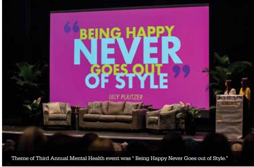
Theme of Third Annual Mental Health event was " Being Happy Never Goes out of Style."